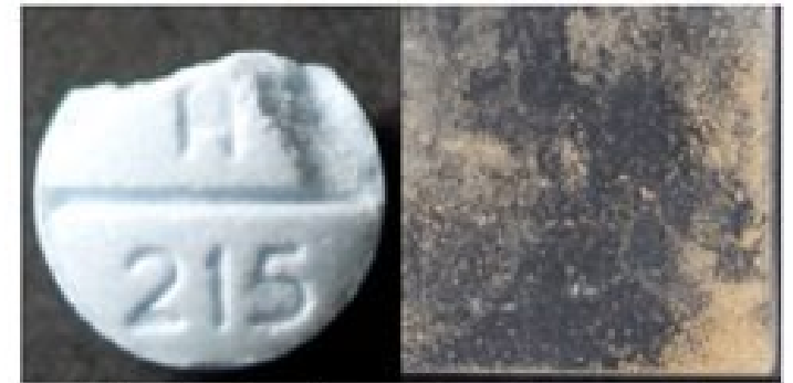
Xylazine has been found in powder residue and counterfeit pain pills.

12,500 xylazine testing strips recently purchased and distributed by the Cuyahoga County ADAHMS Board